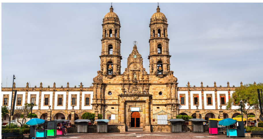
Our Lady of Zapopan