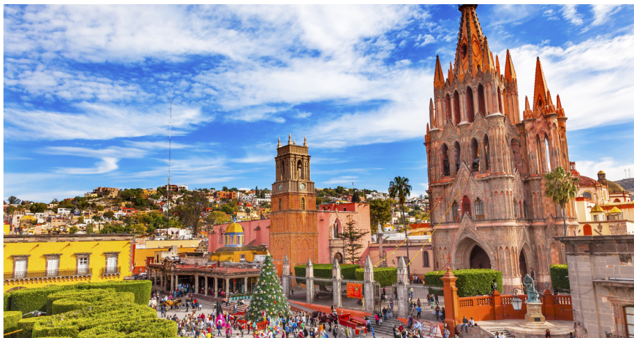
San Miguel de Allende